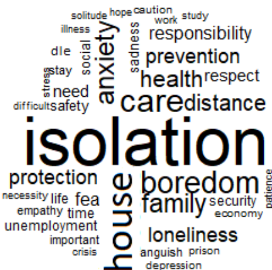
Figure 1. Word Cloud

Initially, the word cloud generated from the participants' evocations was obtained, verifying that the most representative were: "Isolation" ( f = 220 ), "House" ( f = 124 ); "Care" ( f = 94 ); "Boredom" ( f = 87 ); "Anxiety" ( f = 75 ); "Family" ( f = 70 ); "Health" ( f = 60 ) (see Figure 1).